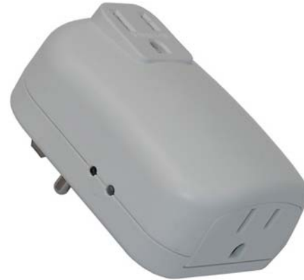
Anywhere Virtual Appliance (Relay) Module 3-prong plug, controlled outlet on bottom, pass through power on front Model: UMA-V0

The Anywhere Virtual Appliance Module is compatible with Simply Automated's "Anywhere" switches, accessories and the Scheduler-Timer (UCS). It is not compatible (will not talk to or work) with any of Simply Automated's PC-Configured, Pre-Configured, SimplySmart™, or other UPB or UPStart configured product solutions.