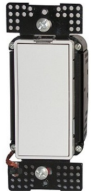
Anywhere On/Off Switch Model: US1-V0