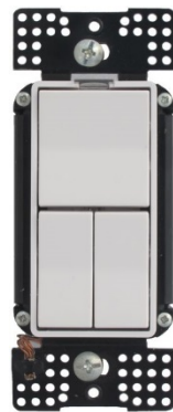
Model US2-V03 Fixed Transmit Channels 1, 2, 4