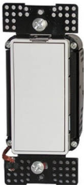
Model US1-V0 Configurable Channels 1-4

Control Anywhere Virtual Switches and Modules