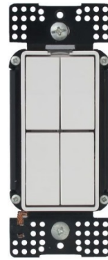
Model US2-V04 Fixed Transmit Channels 1, 2, 3, 4