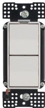
Model US2-V02 Fixed Transmit Channels 1, 2